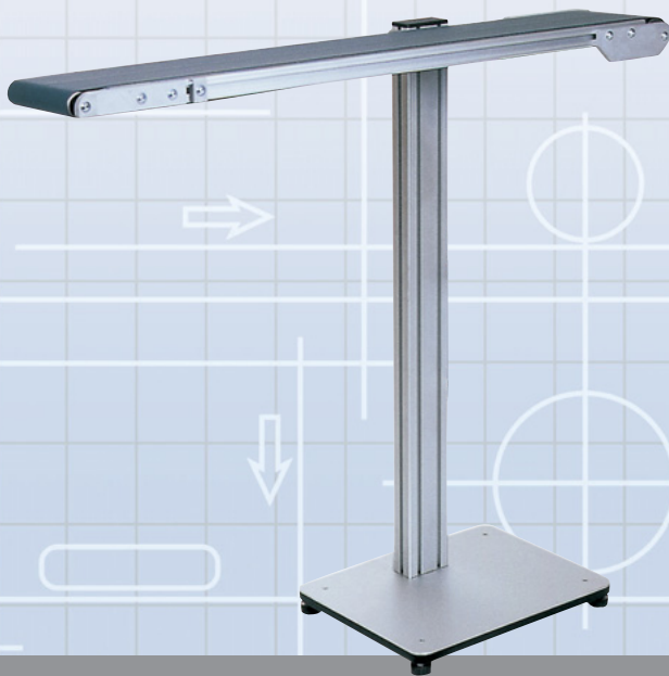
MTF I-Tech Typ IL