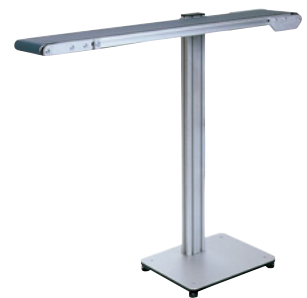
MTF I-Tech Typ IL